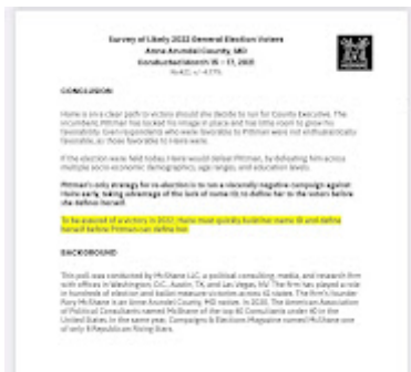
MD GOP Haire 3 (4).jpg 125K